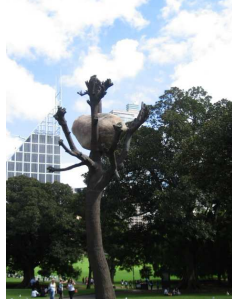
Art in the Domain